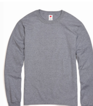
5286 (5 oz.) ComfortSoft® Long Sleeve T-Shirt S-3XL S-3XL: 3 dz/case

*ash: 99% cotton/1% polyester light steel: 90% cotton/10% polyester charcoal heather: 60% cotton/40% polyester oxford gray: 60% cotton/40% polyester safety green: 60% cotton/40% polyester safety orange: 60% cotton/40% polyester pepper heathers: 90% cotton/10% polyester