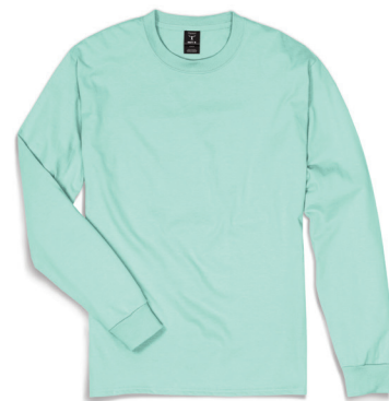
5186 Beefy-T® Long Sleeve T-Shirt S-3XL S-3XL: 3 dz/case

*ash: 99% cotton/1% polyester light steel: 90% cotton/10% polyester charcoal heather: 60% cotton/40% polyester oxford gray: 60% cotton/40% polyester pepper heathers: 90% cotton/10% polyester