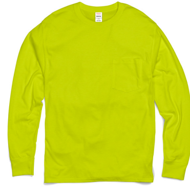
W120 Workwear Long Sleeve Pocket T-Shirt S-4XL S-XL: 3 dz/case 2XL-3XL: 3 dz/case 4XL: 2 dz/case