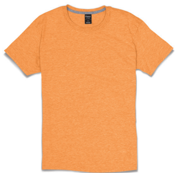
4200 Men's X-TEMP® T-Shirt S-3XL S-XL: 6 dz/case 2XL-3XL: 3 dz/case