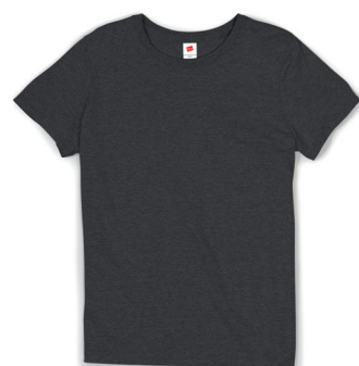
5680 (5 oz.) Women's ComfortSoft® T-Shirt S-3XL S-XL: 6 dz/case 2XL-3XL: 3 dz/case