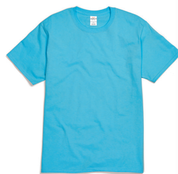
5250 (6 oz.) Authentic-T T-Shirt S-6XL S-XL: 6 dz/case 2XL-4XL: 3 dz/case 5XL-6XL: 1 dz/case