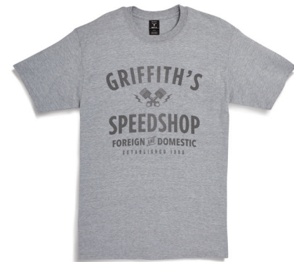
518T Beefy-T® Tall T-Shirt Extra 3" in body length and 1" in sleeve length LT-4XLT LT-4XLT: 2 dz/case