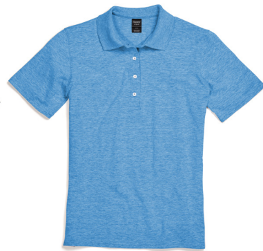
43X0 Women's X-TEMP® Polo Shirt S-3XL S-3XL: 3 dz/case