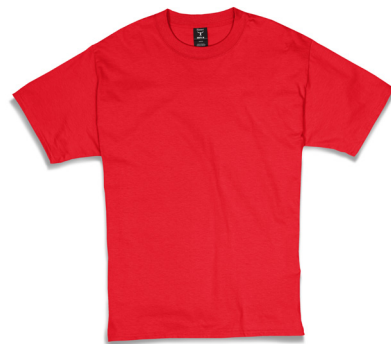
5180 Beefy-T® T-Shirt S-6XL S-XL: 6 dz/case 2XL-6XL: 3 dz/case