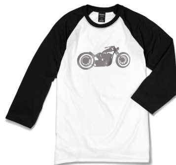
42BA Men's X-TEMP® 3/4 Sleeve Baseball T-Shirt S-3XL S-3XL: 3 dz/case