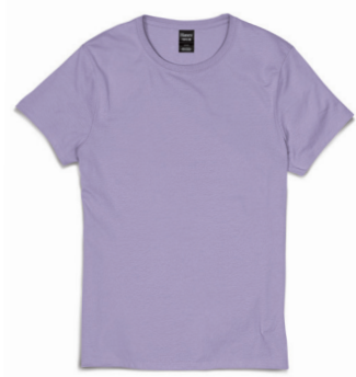
SLO4 Women's nano-T* T-Shirt

S-5XL S-3XL: 6 dz/case 4XL-5XL: 3 dz/case