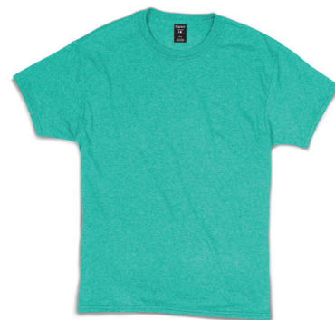
42TB Men's Triblend T-Shirt S-3XL S-XL: 6 dz/case 2XL-3XL: 3 dz/case