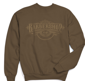
P160 EcoSmart® Fleece Sweatshirt

S-5XL S-3XL: 3 dz/case 4XL-5XL: 2 dz/case