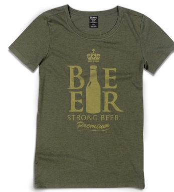
MO150 Women's Modal Triblend Scoop T-Shirt XS-3XL XS-3XL: 2 dz/case