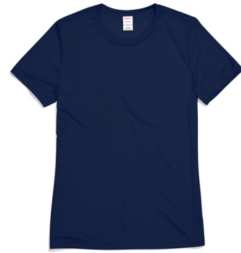
4830 Women's Cool DRI® Performance T-Shirt S-3XL S-XL: 3 dz/case 2XL-3XL: 2 dz/case