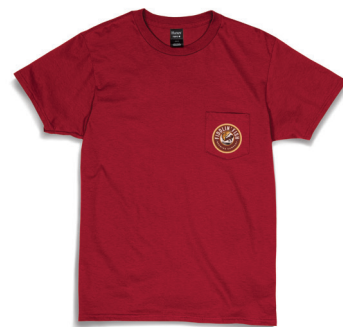
498P nano-T* T-Shirt with Pocket