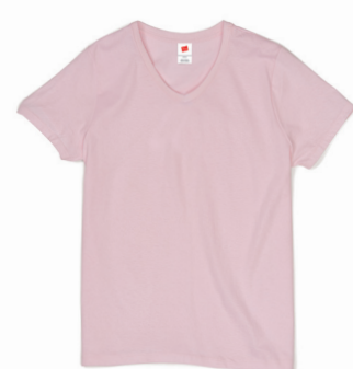
5780 (5 oz.) Women's ComfortSoft® V-Neck T-Shirt S-3XL S-XL: 6 dz/case 2XL-3XL: 3 dz/case