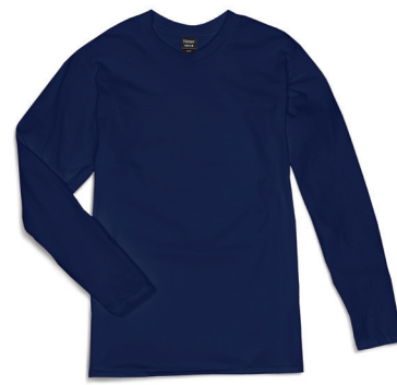
498L nano-T* Long Sleeve T-Shirt