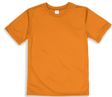
482Y Youth Cool DRI® Performance T-Shirt XS-XL XS-XL: 3 dz/case