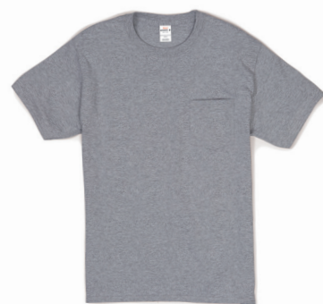
5590 (6 oz.) Authentic-T T-Shirt with Pocket S-3XL S-XL: 6 dz/case 2XL-3XL: 3 dz/case