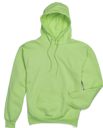
P170 EcoSmart® Fleece Pullover Hoodie