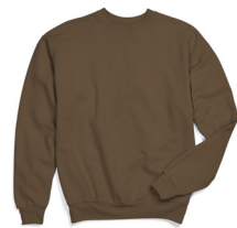
P160 EcoSmart® Fleece Sweatshirt S-5XL S-3XL: 3 dz/case 4XL-5XL: 2 dz/case