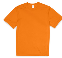
4820 Cool DRI® Performance T-Shirt XS-3XL XS-XL: 3 dz/case 2XL-3XL: 2 dz/case