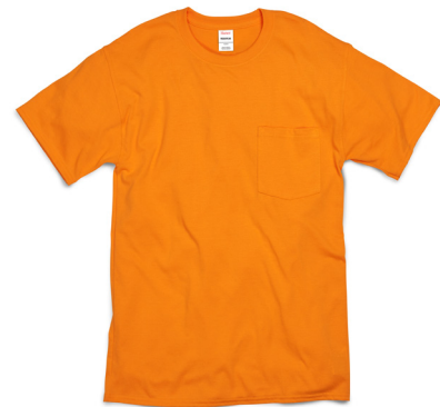
W110 Workwear Short Sleeve Pocket T-Shirt S-4XL S-XL: 6 dz/case 2XL-3XL: 3 dz/case 4XL: 2 dz/case