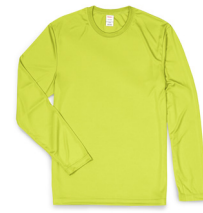
482L Cool DRI® Long Sleeve Performance T-Shirt XS-3XL XS-3XL: 3 dz/case