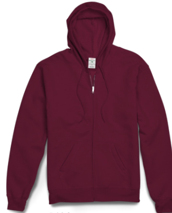
P180 EcoSmart® Full-Zip Fleece Hoodie