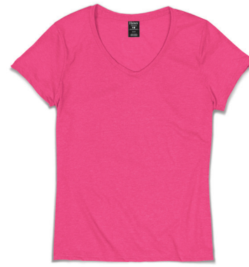
42VT Women's Triblend V-Neck T-Shirt S-3XL S-XL: 6 dz/case 2XL-3XL: 3 dz/case