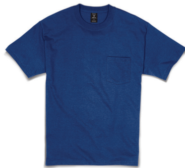
5190 Beefy-T® T-Shirt with Pocket S-3XL S-XL: 6 dz/case 2XL-3XL: 3 dz/case