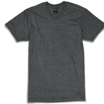
498V nano-T* V-Neck T-Shirt