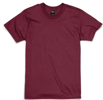
4980 nano-T* T-Shirt

XS-5XL XS-XL: 6 dz/case 2XL-4XL: 3 dz/case 5XL: 1 dz/case