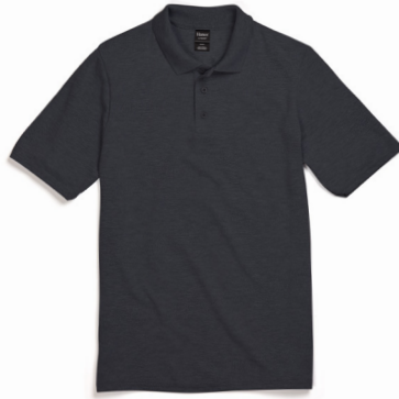
055P Men's X-TEMP® Pique Polo Shirt S-6XL S-6XL: 3 dz/case