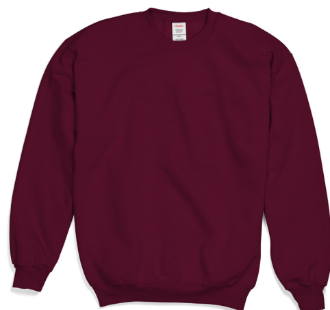
F260 Ultimate Cotton® Fleece Sweatshirt S-3XL S-3XL: 2 dz/case