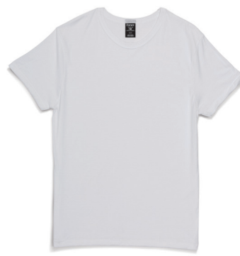
MO100 Men's Modal Triblend Crew T-Shirt XS-3XL XS-3XL: 2 dz/case