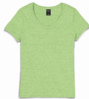
42VO Women's X-TEMP® V-Neck T-Shirt S-3XL S-XL: 6 dz/case 2XL-3XL: 3 dz/case