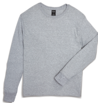
42LO X-TEMP® Long Sleeve T-Shirt S-3XL S-3XL: 3 dz/case