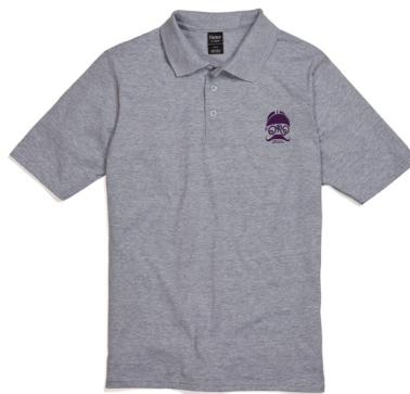
42X0 Men's X-TEMP® Polo Shirt S-3XL S-3XL: 3 dz/case