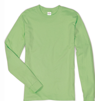
5586 (6 oz.) Authentic-T Long Sleeve T-Shirt S-3XL S-3XL: 3 dz/case