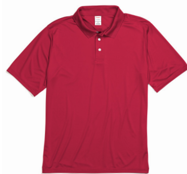
4800 Men's Cool DRI® Polo Shirt S-3XL S-3XL: 3 dz/case