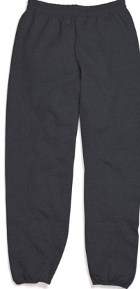
P650 EcoSmart® Fleece Sweatpant