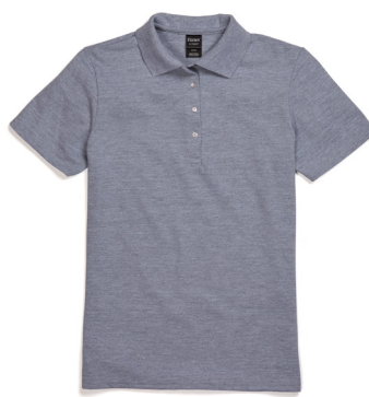
035P Women's X-TEMP® Pique Polo Shirt S-3XL S-3XL: 3 dz/case