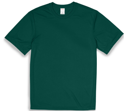
4820 Cool DRI® Performance T-Shirt XS-3XL XS-XL: 3 dz/case 2XL-3XL: 2 dz/case