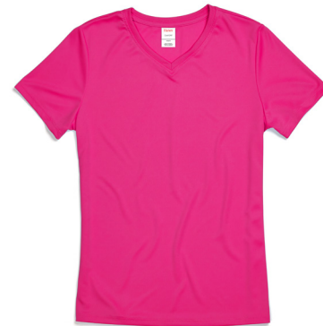
483V Women's Cool DRI® Performance V-Neck T-Shirt S-3XL S-XL: 3 dz/case 2XL-3XL: 2 dz/case