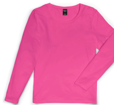
S04LS Women's nano-T* Long Sleeve Scoop T-Shirt

S-5XL S-XL: 6 dz/case 2XL-3XL: 3 dz/case 4XL-5XL: 2 dz/case