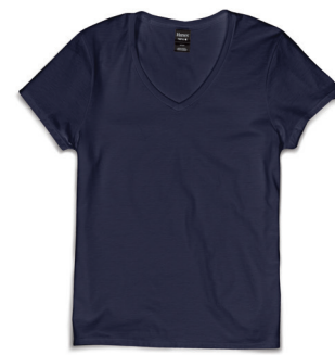
S04V Women's nano-T* V-Neck T-Shirt

S-5XL S-3XL: 6 dz/case 4XL-5XL: 3 dz/case