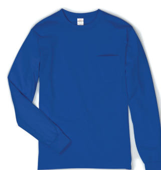
5596 (6 oz.) Authentic-T Long Sleeve T-Shirt with Pocket S-3XL S-3XL: 3 dz/case