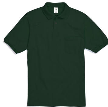
0504 EcoSmart® Jersey Polo Shirt with Pocket S-4XL S-4XL: 3 dz/case