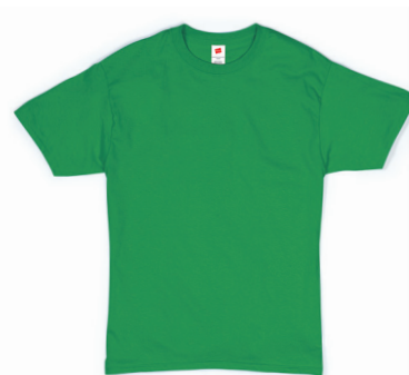
5280 (5 oz.) ComfortSoft® T-Shirt S-6XL S-XL: 6 dz/case 2XL-4XL: 3 dz/case 5XL-6XL: 1 dz/case