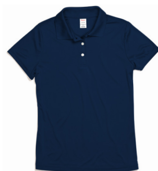
480W Women's Cool DRI® Polo Shirt S-3XL S-3XL: 3 dz/case