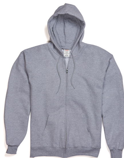
F280 Ultimate Cotton® Fleece Full-Zip Hoodie S-3XL S-2XL: 2 dz/case 3XL: 1 dz/case