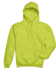
P170 EcoSmart® Fleece Pullover Hoodie S-5XL S-5XL: 2 dz/case