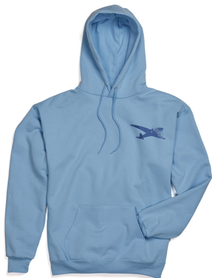
F170 Ultimate Cotton® Fleece Pullover Hoodie S-3XL S-2XL: 2 dz/case 3XL: 1 dz/case

An easy-to-print canvas that keeps you wrapped in warmth and softness year-round.