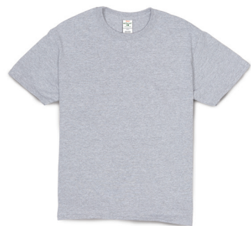
5170 EcoSmart® T-Shirt

S-5XL S-XL: 6 dz/case 2XL-4XL: 3 dz/case 5XL: 1 dz/case