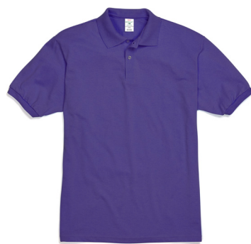
054X EcoSmart® Jersey Polo Shirt S-6XL S-6XL: 3 dz/case