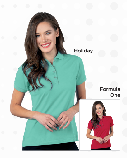
KL505 Women's Luxe Polo