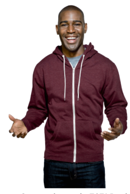
Companion style F671 Devin. Page 169, Tri-Mountain '20 Catalog. Fabric content is different than F671.