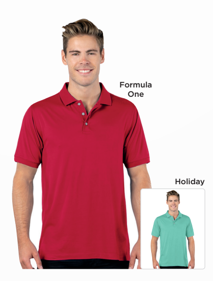
K505 Men's Luxe Polo